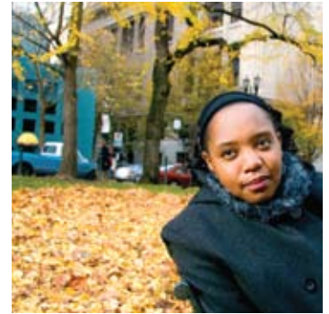
Autumn day in Portland

Multnomah County is an equal opportunity employer.