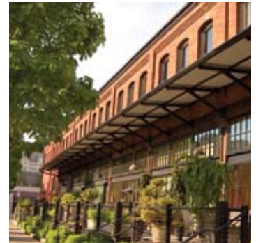
The Pearl District